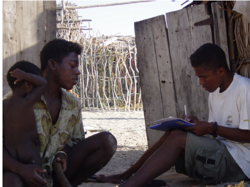
Plate 1. A Key informant interview in progress- Velonriake.