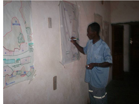
Plate 2. Drawing up boundaries for the Velondriake community managed protected area.

The socioeconomic assessment provided an overview of the area including the stakeholders, demographics, infrastructure, business development and community profiles, identifying threats and problems facing traditional coastal livelihoods in the region. Marine activities affecting coastal and marine resources were also monitored to establish a reference against which future changes in use patterns could be observed, in particular those resulting from environmental management and conservation activities. The socioeconomic assessment also included data collection on awareness of rules and regulations, as well as community attitudes and perceptions on marine resource conditions and marine management initiatives. The SocMon study, the first of its kind in Madagascar, was initiated using a combination of research methods including questionnaires, key informants (Plate 1) and focus group interviews based on the SocMon WIO guidelines. Prior to monitoring on-site training was conducted, covering field data collection, interview techniques, database use, data analysis and dissemination. This study was completed