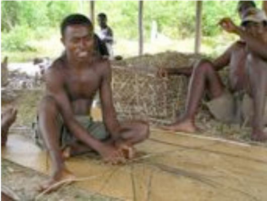
Figure 3. Fish trap construction in Tanjona.

most frequently used gear, followed by handlines, gleaning, traps, and spearguns. Gleaning consisted of collecting octopus and sea cucumbers from intertidal or shallow subtidal reef flats. Spears were frequently used in octopus collection. Traps were constructed out of local materials and generally had mesh gauge of approximately 3 inches (Fig. 3).