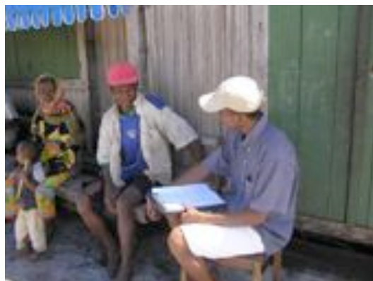
Figure 1. Conducting a household survey in Ankitsoko.

Sampling of households within villages was based on a systematic sample design (see Henry, 1990; de Vaus, 1991). In very small communities (<30 households), a whole haul census was generally attempted (but never achieved because of long term absence of specific residents). A household was defined as people living together and sharing meals. Variance from the systematic sample was assumed to be equal to the estimated variance based on a simple random sample (Scheaffer et al., 1996). The number of surveys per park ranged from 43-70. The number of surveys per community (within each park) ranged from 7-44 (Table 1), depending largely on the population of the