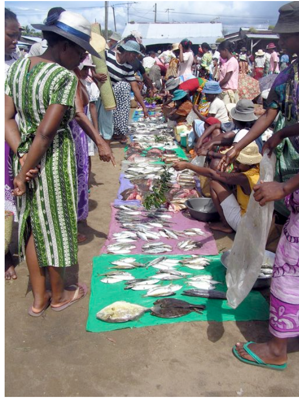
Figure 4. Regional fish market (in Maroantsetra).

At the sites examined, fish marketing was entirely by small-scale traders for local consumption (Fig. 4). Very few respondents reported being involved in buying and selling fish or marine products. The exception to this is involvement in the sea cucumber industry, particularly in Sahamalaza and Tampolo (Masoala peninsula). In contrast to Kenya, where small-scale traders bought fish at landing sites, did some processing (scaling, gutting, and possibly cooking), and either sold fish in local open air markets or transported fish to urban centers (i.e., Mombasa or Malindi) for sale in retail fish shops, fish marketing in Madagascar was done primarily by the fishers and their family. Poor transportation and low fish prices meant that many communities were not heavily integrated into provincial or national markets. There were no medium-scale (i.e. traders with freezers or refrigerated storage capacity) or large scale (i.e. traders with exporting facilities) fish sales or processing at any of the sites assessed in this study.